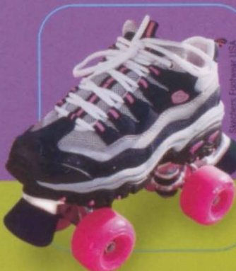
Skateboard Footwear USA

↓ Teens across the country are on a roll with retro style roller skates and the newest fad: shoes with retractable wheels.